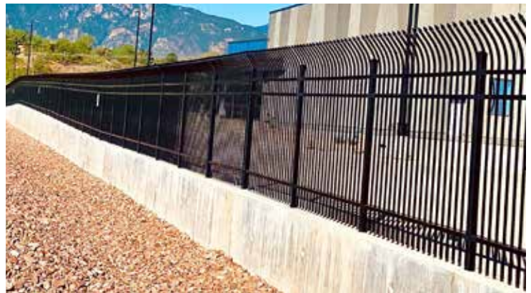
» Data centers

COLORADO SPRINGS 601 S. Wahsatch Ave, Unit A, 80903